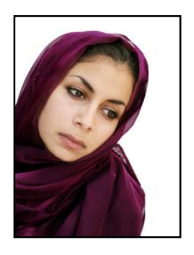
Be careful not to stereotype people based on their appearance or clothing.

• Example: Most white Americans value privacy, especially when they are sick. Often, they will pay more for a private room in a hospital and probably want to have a lot of private time. However, people from other cultures—such as Asians and Hispanics—tend to stick closely to sick family members. They put more value on the strength of the family than they do on privacy.