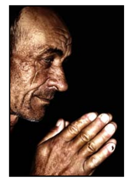
People in many cultures rely on faith healers rather than physicians to cure their illnesses.