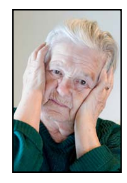
Dementia affects people of all races and cultures. Worldwide, there is a new case of dementia every seven seconds!

This information on cultural beliefs and dementia has been gathered from a variety of research studies and surveys. It is adapted here from information found on the Ethnic Elders Care Network.