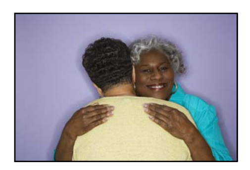
African Americans tend not to be concerned about dementia until the symptoms are advanced.

medical diagnosis of dementia to describe someone's condition, some African Americans prefer to use terms like "his mind is slipping" or