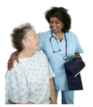
Every person has the right to receive courtesy and respect from others.